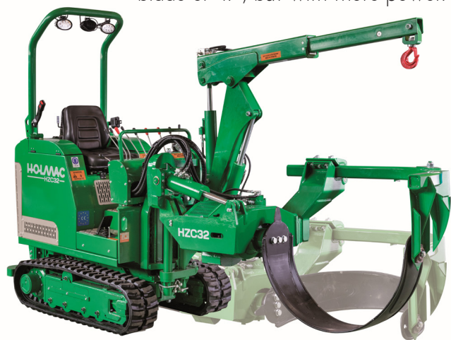
18" Vertical Lift

The HZC 32 is a machine projected and built to grant the best work capacity with the biggest security and results. This machine is in the middle between the HZC 29 and the HZC 38 with the blade of 47", but with more power. This machine is a development of the HZC 29, that in 1999 was the first one to work with the system of vertical lift up of the rootball with the blade. With this machine, moreover, we highly reduced the vibrations and increased the comfort for the operator with a better visibility during tree-digging. (Optional Crane Available)